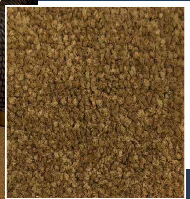
Breeze 4601 - Camel