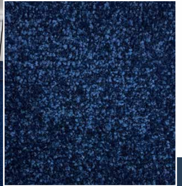
Breeze 4604 - Blue