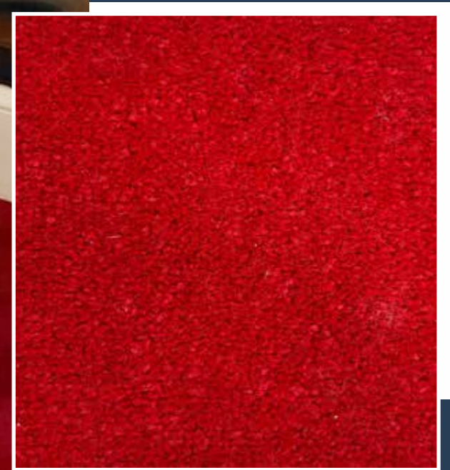
Breeze 4610 - Red