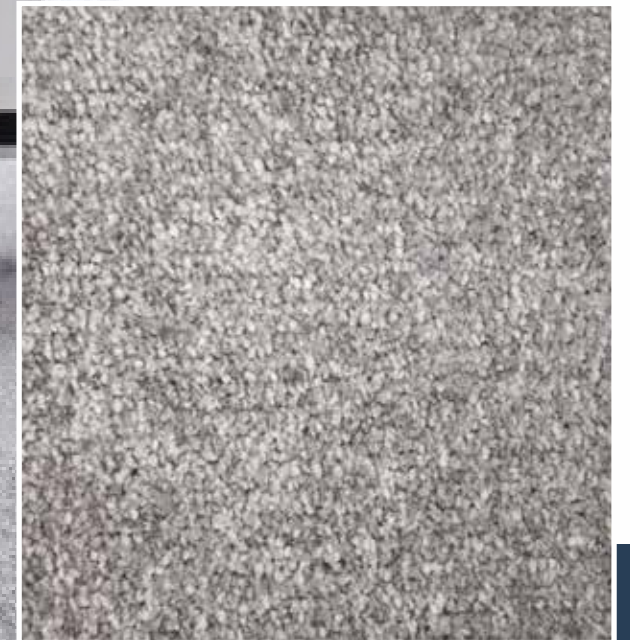
Breeze 4605 - L. Grey