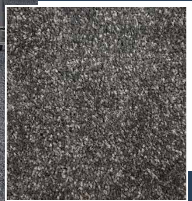
Breeze 4603 - D Grey