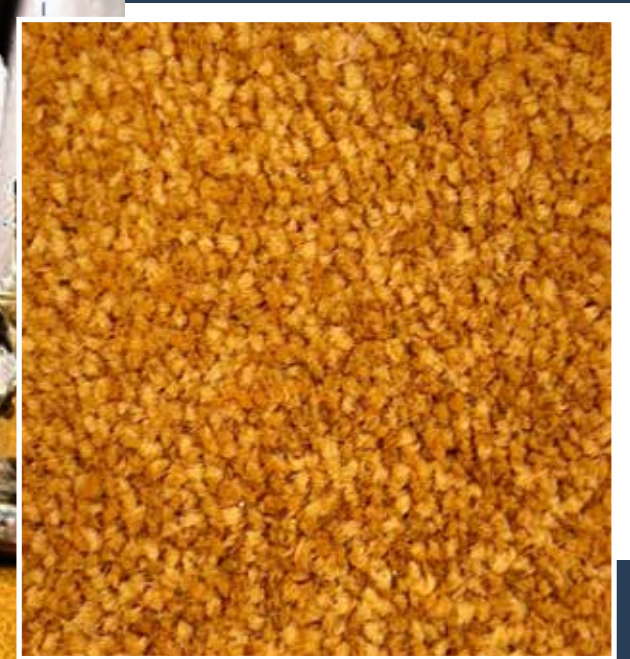
Breeze 4612 - Gold