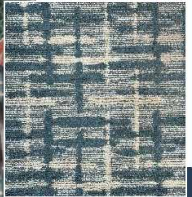
Blend 4512 - Blue