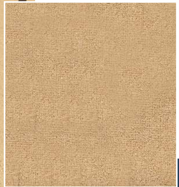
Dyna 3707 - L. Brown