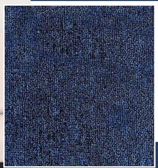
Dyna 3702 - P. Blue