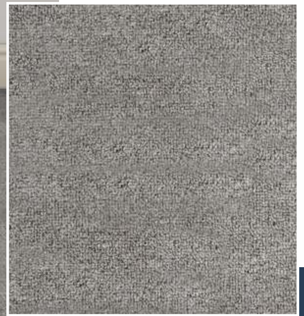
Dyna 3706 - L. Grey