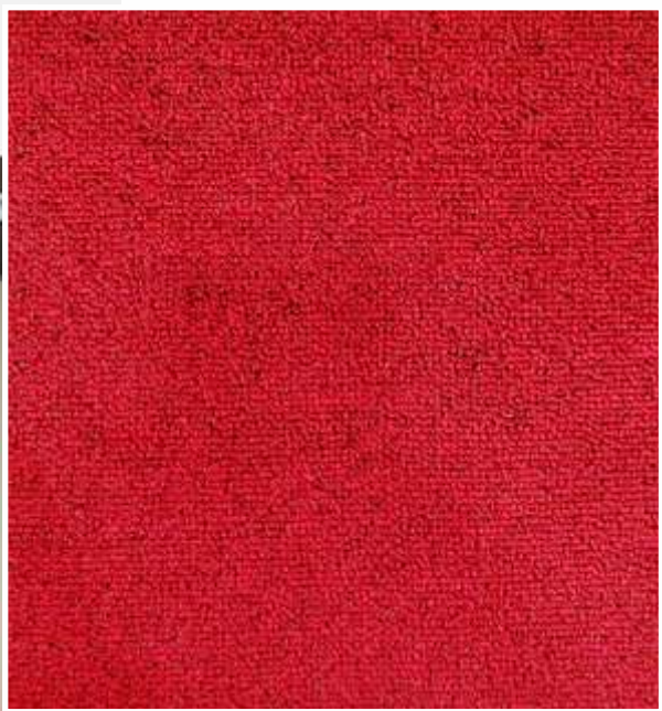
Dyna 3701 - Red Black