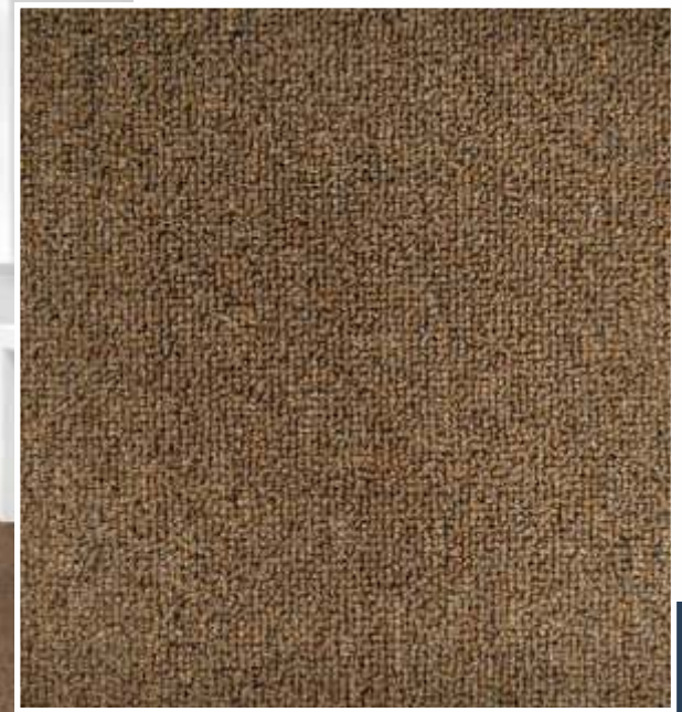
Dyna 3704 - D. Brown