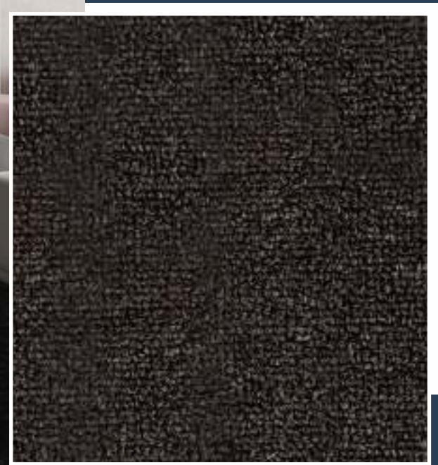
Dyna 3708 - D. Grey